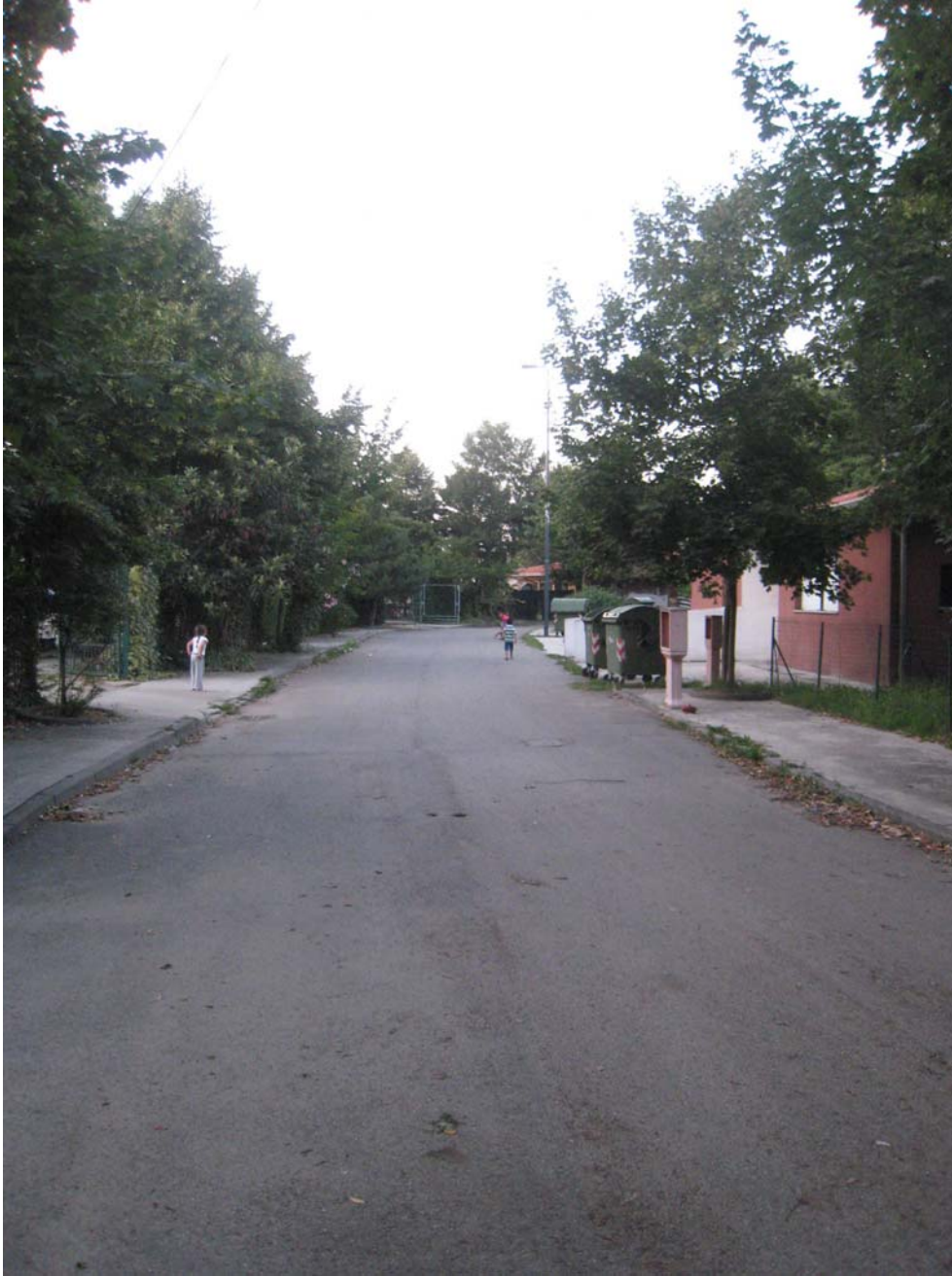
A view of the camp in Via Idro.