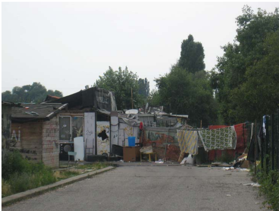
The authorized camp of Via Novara, inhabited by Roma from the Former Yugoslavia, July 2011.