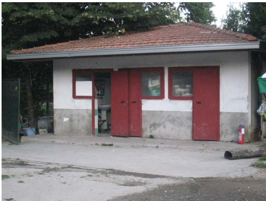
Toilet facilities in the authorized camp of Via Idro, July 2011.