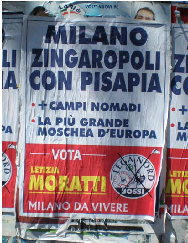
Election poster of the political party “Northern League”.