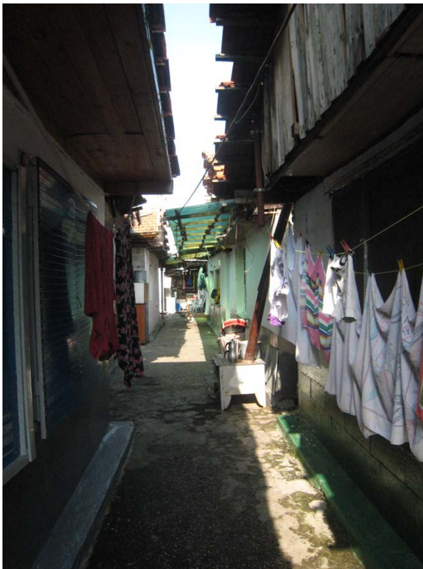
The authorized camp of Via Novara, July 2011.